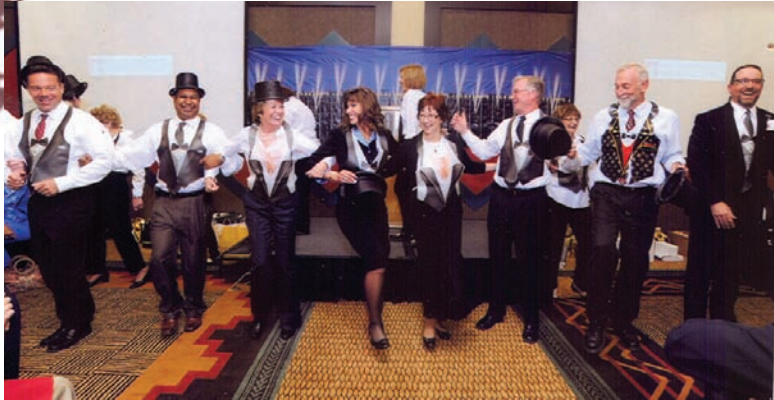
"One Singular Sensation" - ADCO members kick line