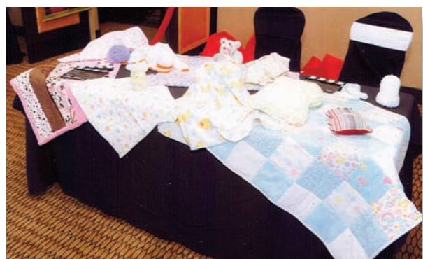
Donated Stitchery made by our Monday Club Sunshine Stitches, Yavapine Needles, Hug-A-Bears and Individuals