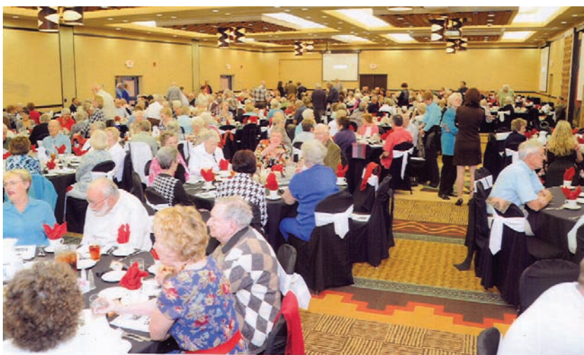
Biggest Turnout Ever!!!

April is National Volunteer Month and capping the celebrations was our annual recognition at the Prescott Resort on April 25 th . If you missed this one, you really missed quite an event! It was a Hollywood themed party and it was universally deemed the best one we've ever had!