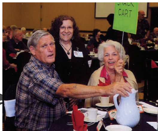
Snack cart folks