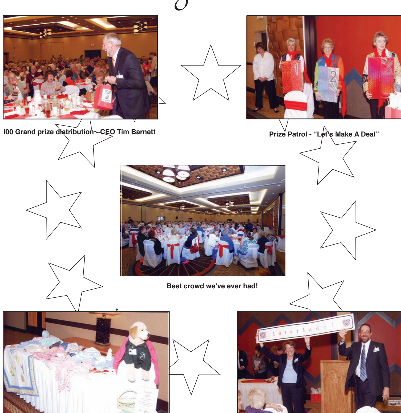
Donated Stitchery by our Monday Club Sunshine Stitchers, Yavapine Needles, Hug-A-Bears and indivduals, plus PAWS mascot, who needed a name!